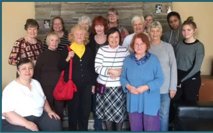
November Women's Retreat at Ganaraska Woods